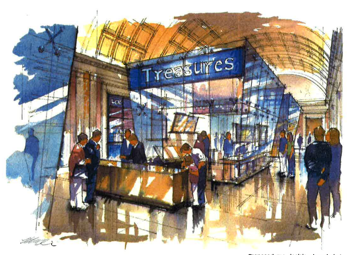
Proposed, pre-decisional rendering