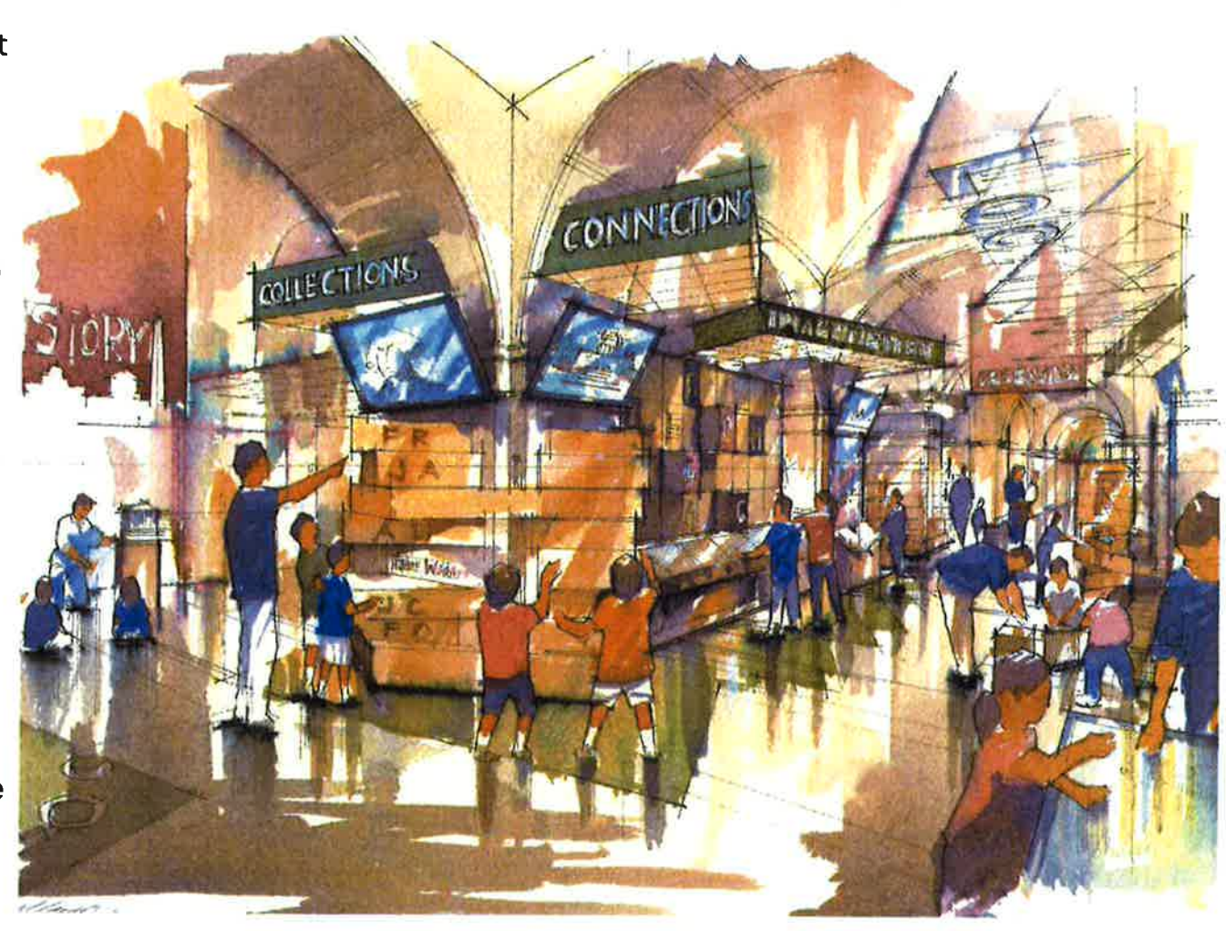
Proposed, pre-decisional rendering